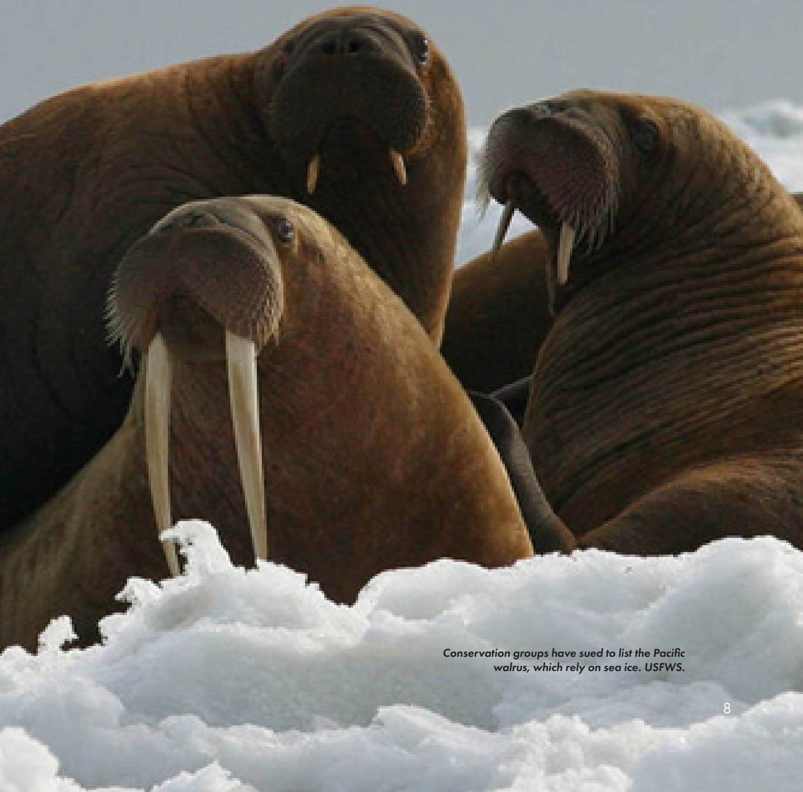
Conservation groups have sued to list the Pacific walrus, which rely on sea ice.

We provide these recommendations to encourage a broader dialogue on the need to prioritize urgent ESA policy improvements in response to a rapidly changing world and to develop better strategies for threats that are beyond the ESA's current reach.