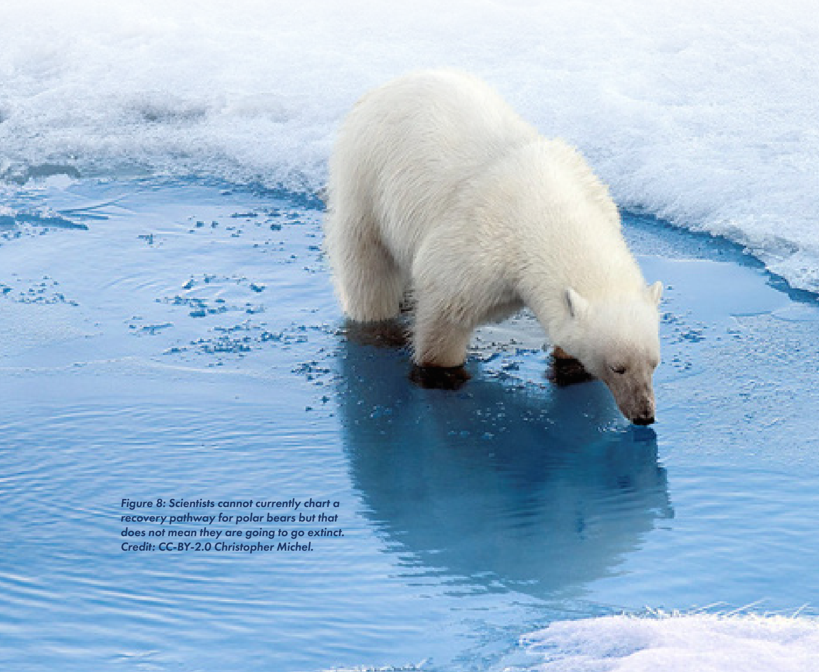
Figure 8: Scientists cannot currently chart a recovery pathway for polar bears but that does not mean they are going to go extinct.

The reality is there is an enormous distinction between extinction prevention and recovery; in fact, they are on the opposite ends of the ESA extinction risk continuum. To say that a species is currently recovery-limited implies very little about whether it is doomed to extinction. For example, scattered and isolated bog turtle colonies with low abundances can persist for decades, but this says nothing about whether enough funding, private landowner support, and other measures exist to recover the species. 20