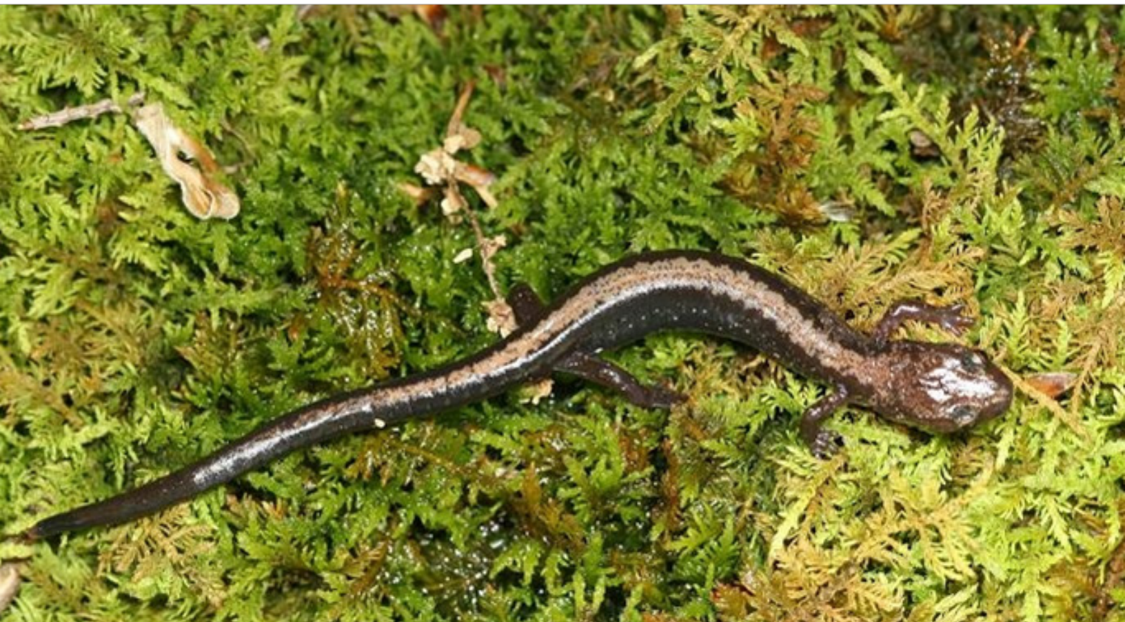
Figure 1. The Shenandoah salamander is not listed under the ESA, but climate change is projected to drastically alter its habitat in the Appalachians. Even if listed in the future, the protections of the ESA are unlikely to significantly improve the species' status – its future depends on programs other than the ESA.