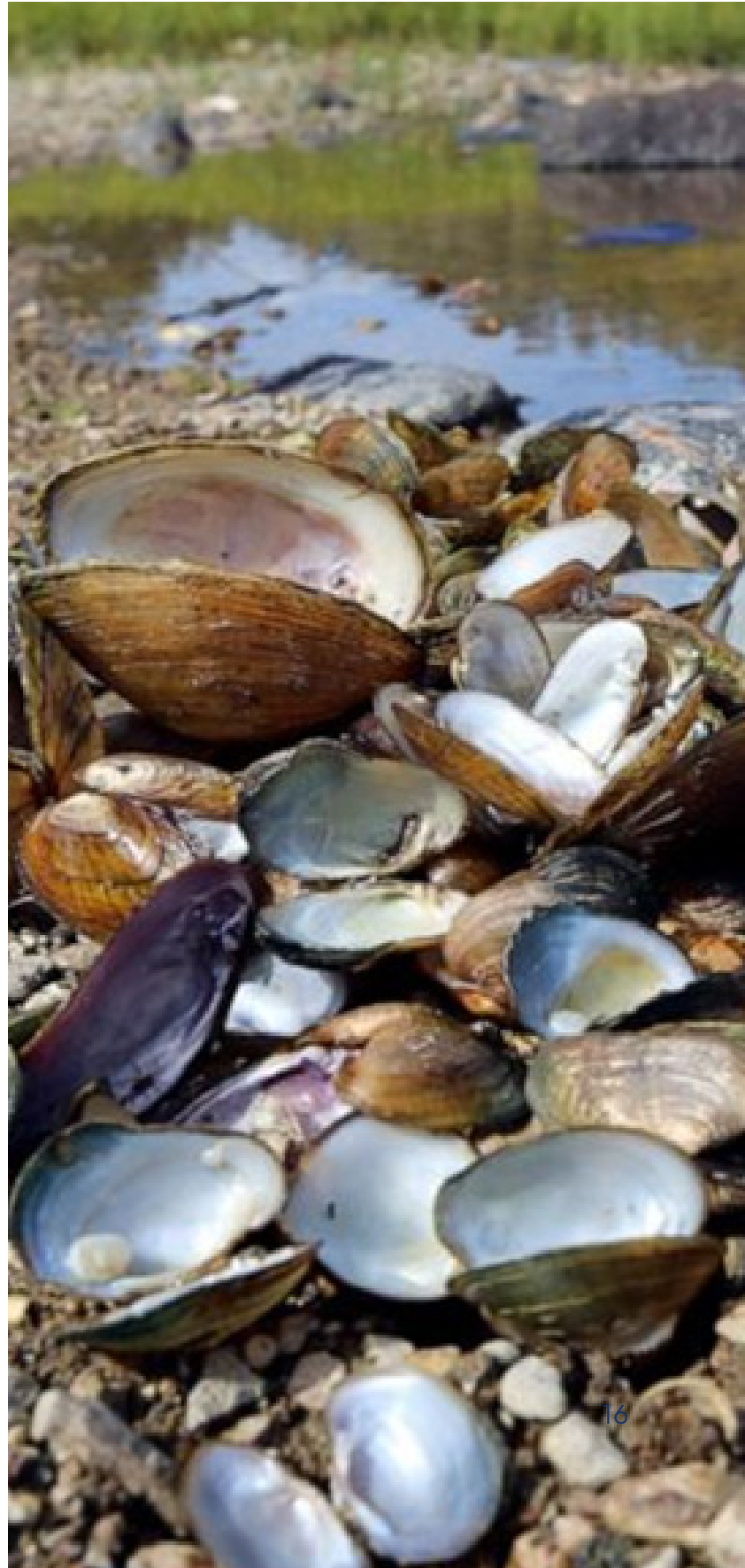
Figure 6: Freshwater mussels are one of the most imperiled groups of ESA species, but receive far less public attention and funding than high-profile or controversial species.

Species with dangerously low abundances are not limited to Hawaii. Throughout the continental U.S., highly imperiled species include the ring pink mussel (only 2 found in the last 15 years) and poweshiek skipperling butterfly (decline from 12 to 7 occupied sites since 2014 listing). These highly imperiled species should be the highest conservation priority under the ESA, because extinction prevention is arguably the law's most urgent goal. The recent delisting of over a dozen species is cause for much celebration but should not divert attention from the many other species on the other end of the conservation spectrum, many of which have sat there for over a decade.