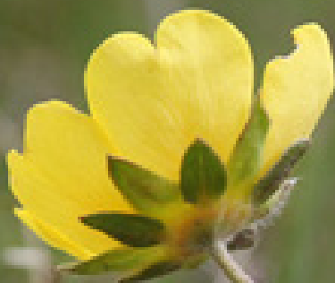
Figure 9: The endangered Hickman’s cinquefoil has been categorized by scientists as being in “injurious neglect” by managers, meaning that it is in obvious decline yet barely receiving any funding.

One way to improve budgeting is by reallocating some of the funding for improving species to those in decline that have been underfunded (so called “injurious neglect” species). 23