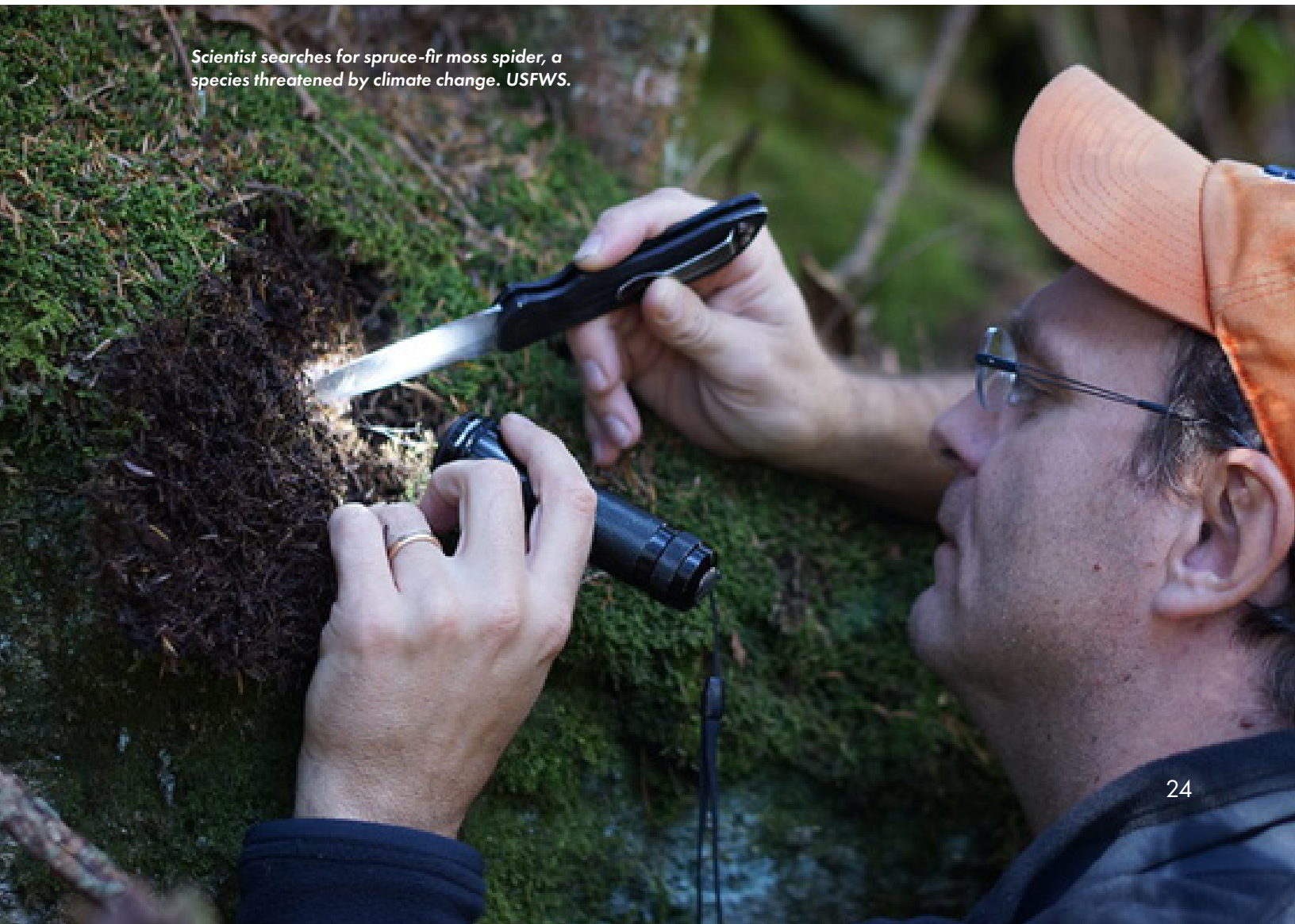
Scientist searches for spruce-fir moss spider, a species threatened by climate change.

More broadly, a national conversation is needed to identify specific endangered species conservation goals over the coming decades—especially in light of climate change, drought, wildfire, infrastructure development, and other impacts on species—and how to allocate funding to advance those goals. For example, if certain major threats are expected to increase in the future and block paths to recovery, dedicated funding to address those threats is needed. The funding from FWS’s Ecological Services budget is vastly inadequate to address those threats, yet for many species no other source of funding is available.