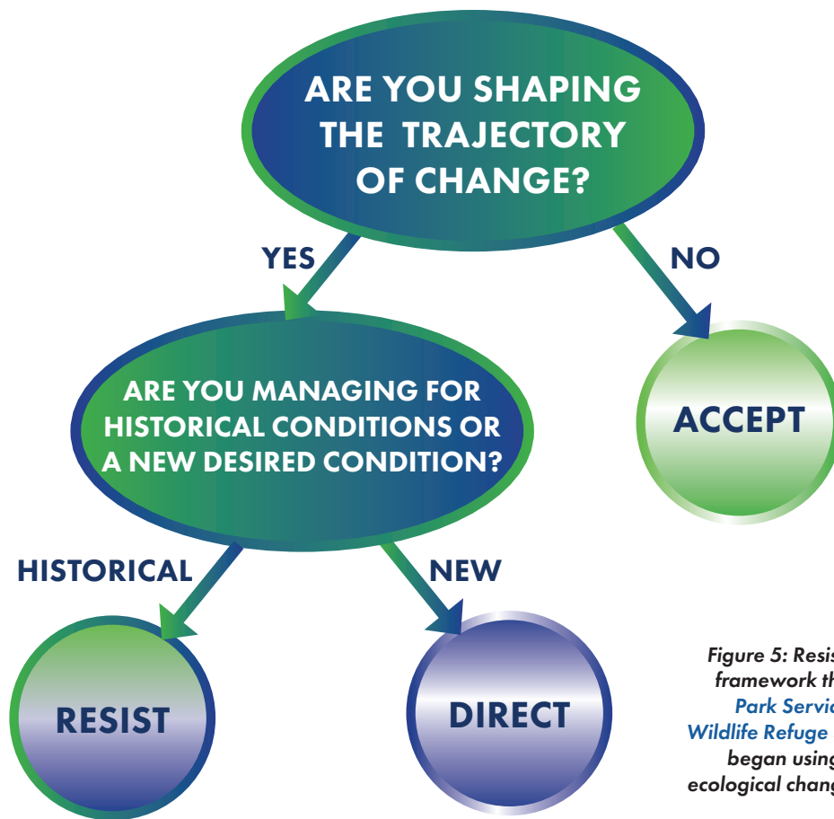
Figure 5: Resist-Accept-Direct framework that the National Park Service and National Wildlife Refuge System recently began using to manage for ecological change.

To help translocate wide-ranging species or a group of species that inhabit a certain ecosystem, Congress should consider giving federal agencies direction or guidance on those efforts. Otherwise, translocations will likely occur on a very slow, species-by-species or location-by-location basis—one that is outpaced by the rate at which climate change and other threats are rendering habitats unsuitable. One approach is for Congress to create a new category of section 10(j) experimental populations for climate refugee species that need a vastly expanded or different range to survive or recover. Any such amendment should also address how sections 7 and 9 protections, and critical habitat designation, would apply to the experimental populations, with the goal of encouraging state agencies to support the creation and management of those experimental populations.